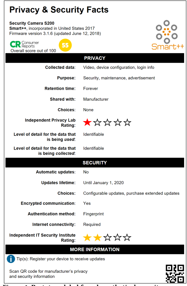
Figure 1: Prototype label for a hypothetical security camera with poor privacy and security practices.

One of the researchers was the primary coder, responsible for creating and updating the codebook. To analyze the interview data, we applied structural coding to the interview